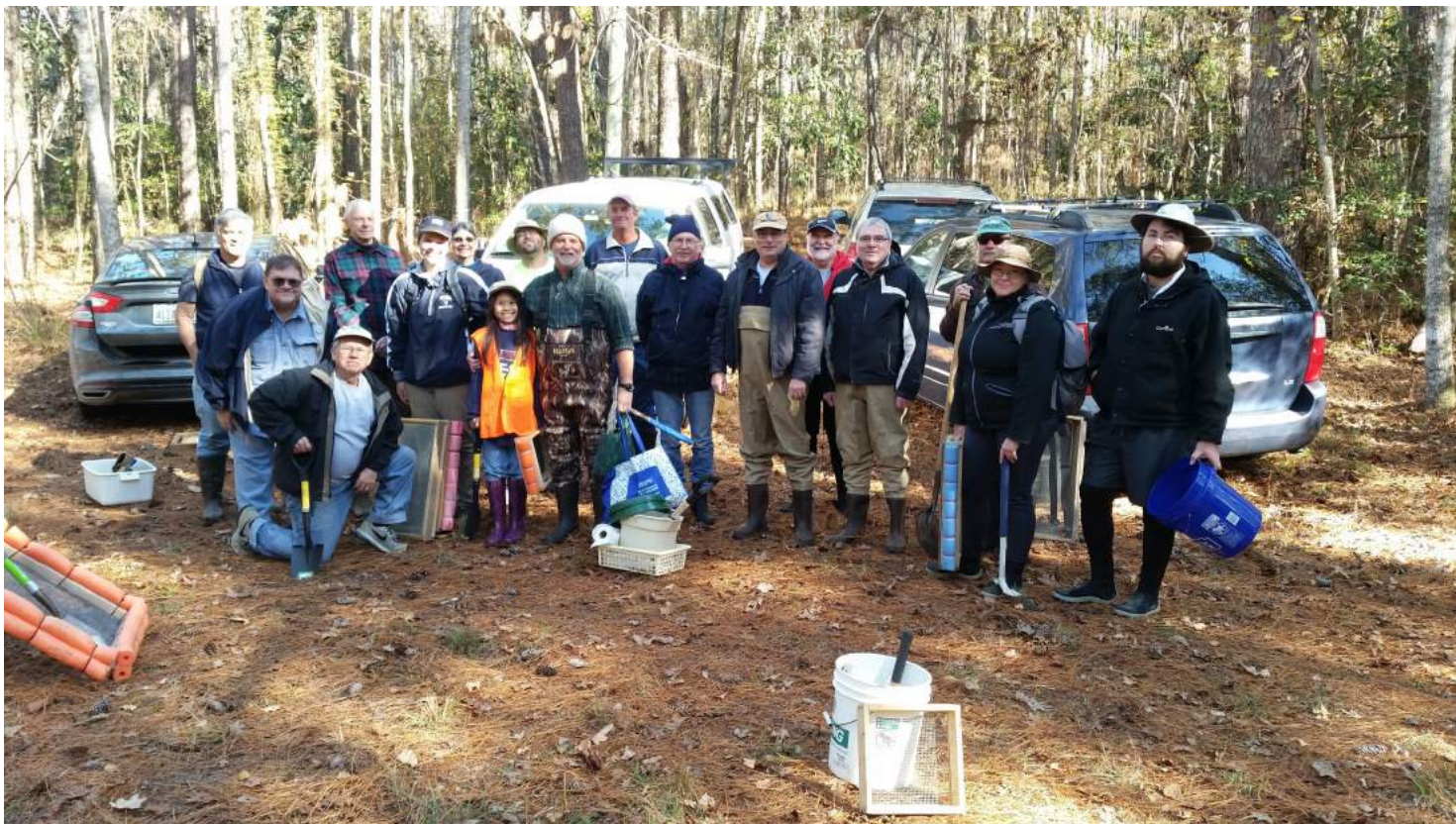
Fall attendees of the trip pose for a pre-creek photo– everyone is ready and excited to collect!

After a chilly and exciting day of collecting, members retired to their rooms for showers and naps before the final events of the day. The meeting continued with a delicious dinner at The Oaks with discussions of pteropods and baked potatoes. There was no auction this year, as time and space did not allow for it, but this only meant that the auction at the upcoming meeting will be particularly spectacular (editor's note: most agreed it was!). Stay tuned! Following the dinner, the board met to discuss agenda items before concluding the meeting and turning in for the evening. Thank you to everyone for a good trip!