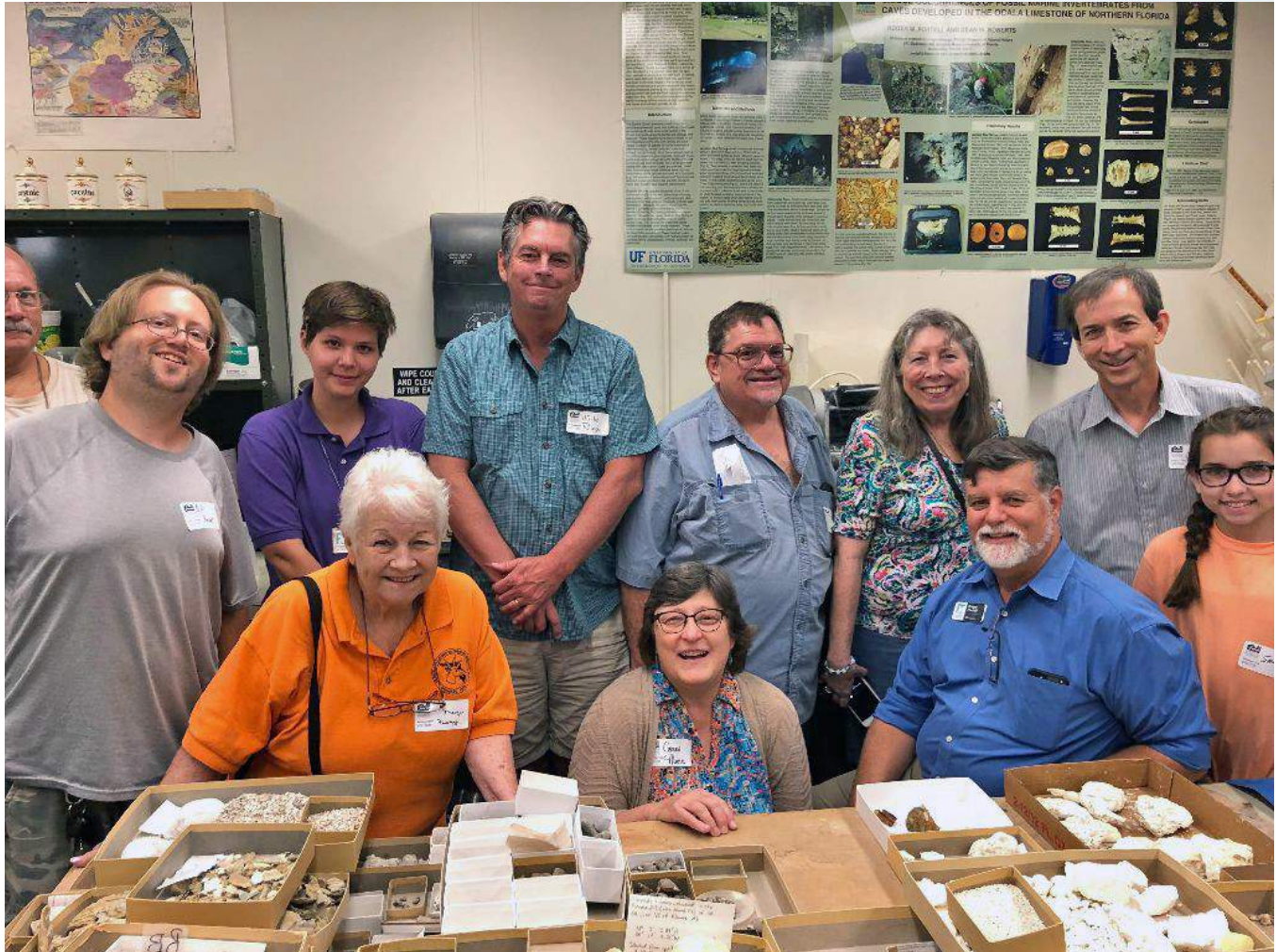
FPS tour members enjoying a special photo opportunity with the Invertebrate Paleontology Collections staff